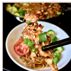
B E E ' S Noodles