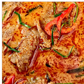
Beef Panang Curry