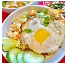
Seafood Fried Rice

Made with beef or shrimp or tofu $18.59 | chicken $16.59