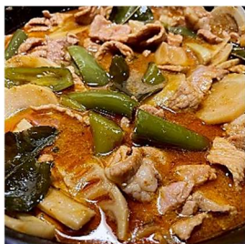
Pork Red Curry

Protein: beef, shrimp or tofu $17.59 | pork, chicken or veggie $15.59 ( gluten free, vegetarian friendly )