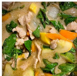
Pork Green Curry

Protein: beef ( recommended ), shrimp or tofu $17.59 | pork or chicken or veggie $15.59 ( gluten free, vegetarian friendly )