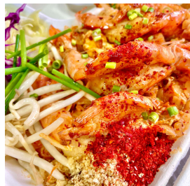
Shrimp Pad Thai

Open: Mon-Sat | 11 am-3 pm | 6 pm-10 pm | Close: Sun