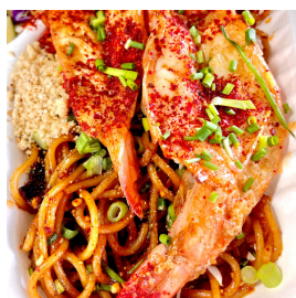
AShrimp BEE'S Noodles

Special: Don't eat meat? You can go with the Basic Pad Thai for $12.59 (vegetarian friendly)