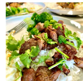
Khao Nuea Tod (beef)

(This is one of my favorite comfort Thai foods)