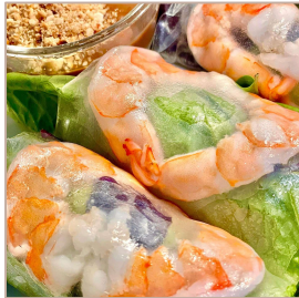
Shrimp Fresh Rolls

Open: Mon-Sat | 11 am-3 pm | 6 pm-10 pm | Close: Sun