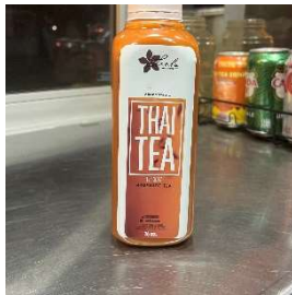
Fresh Thai Tea

B E E ' S style serves with coconut- syrup (pandan flavor) and finished with salted coconut milk