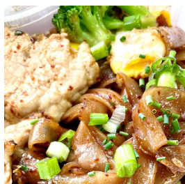
Pork Pad See Ew

Protein: beef or shrimps or tofu $17.59 | pork or chicken or veggie $15.59 (vegan, vegetarian friendly)