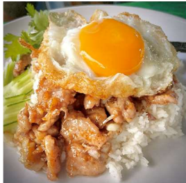
Thai Garlic Pork